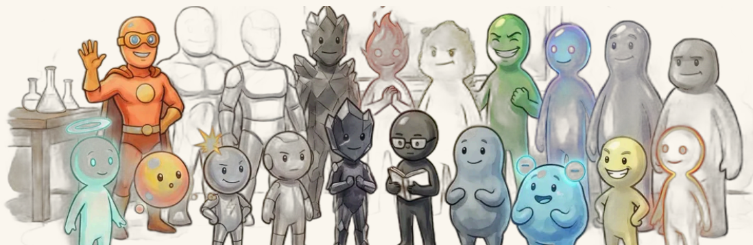
FIG. 1. The full cast: 118 elements, most of whom you haven't met yet.

$250 to the first student who masters all 118 elements before chemistry class starts.